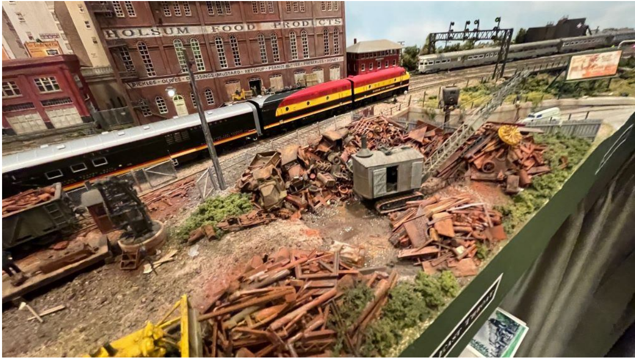
Nick isn't afraid to rust things up! Cool car up on the sign frame (just like the prototype, naturally)