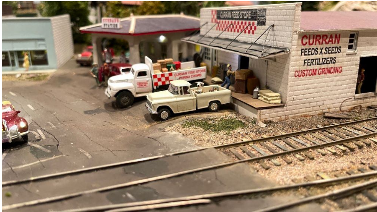
A look down Main Street in Gentry, Arkansas.