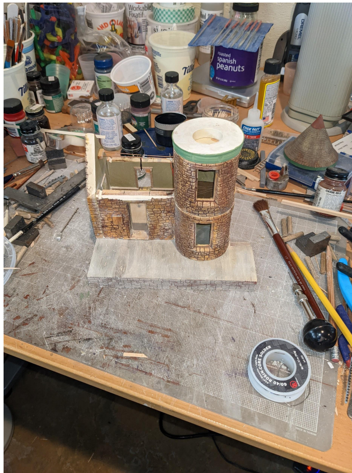
The workbench of a hard working modeler.