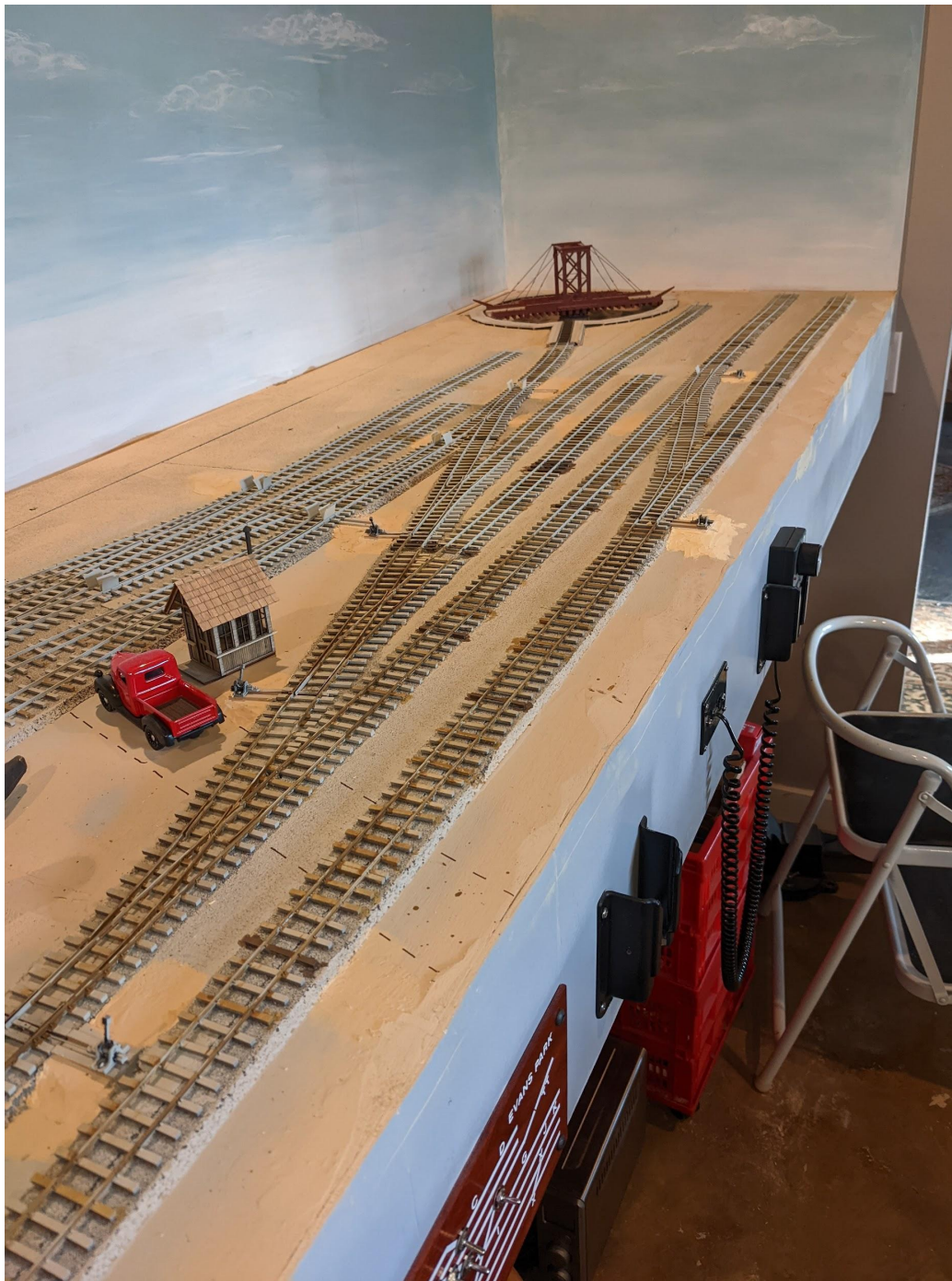
Quite a bit of progress on Evans Park (first scene to the right as you enter the layout room). Track painted and ballast soon then scenery. Track tested and everything works.