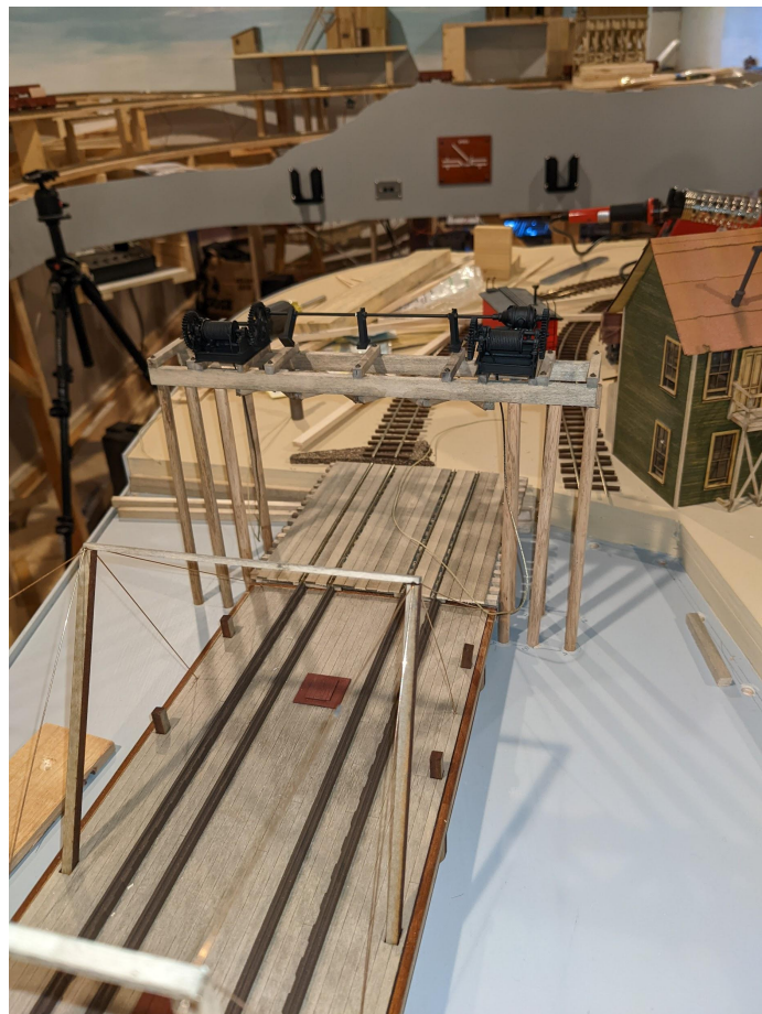
The hoist for adjusting the loading dock.