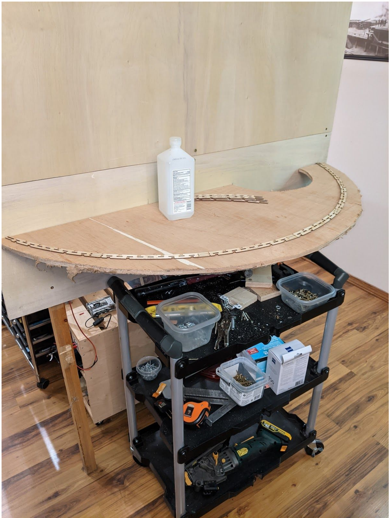
This is the end of the peninsula which will support a curved trestle.