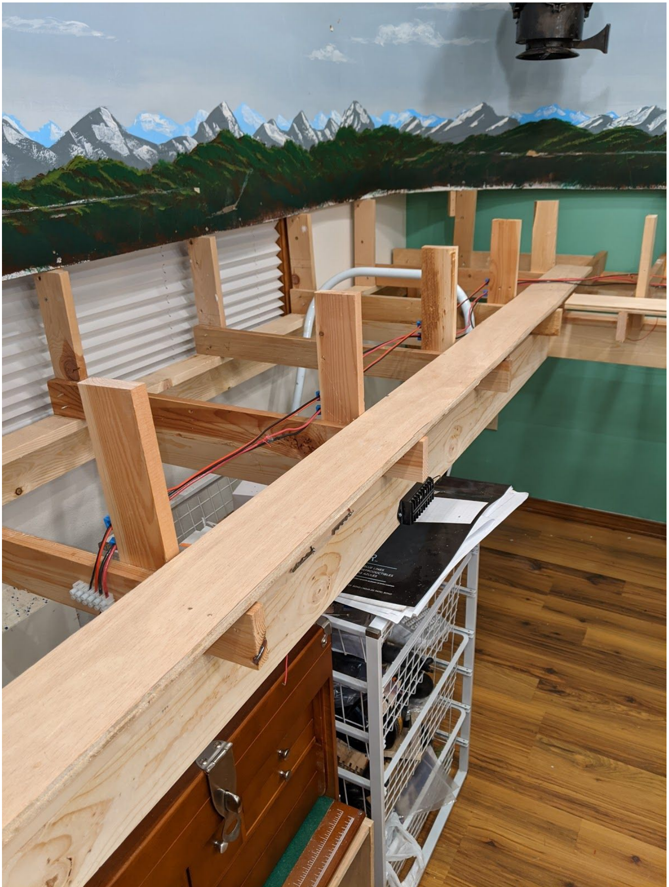
A closeup of the benchwork. \frac{3}{4} inch plywood will rest on top of the upright 1X3's.