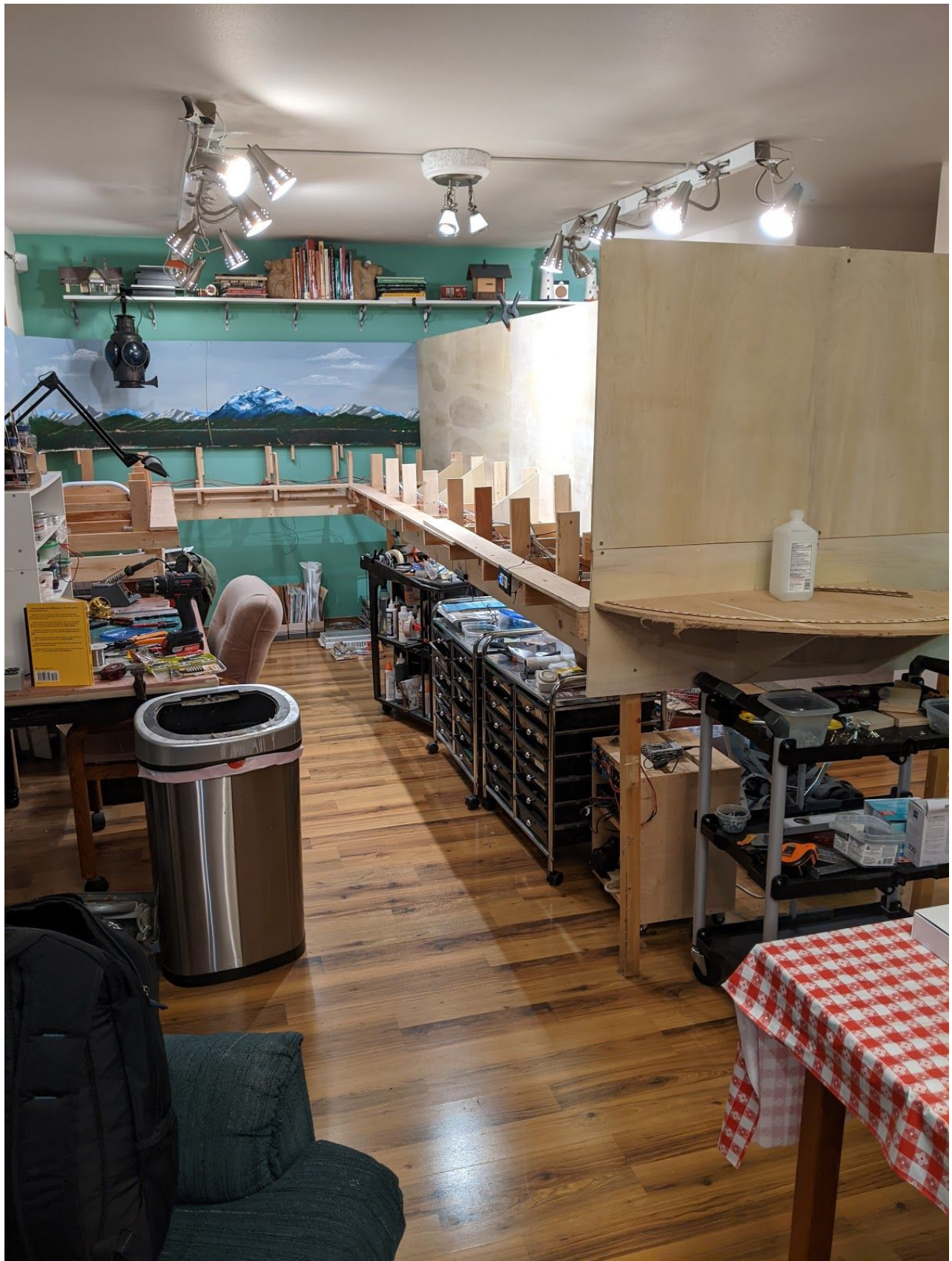
This is a view of the 14 foot peninsula