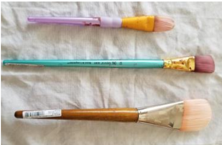
Assorted Filbert Brushes

My favorite brushes for scenery painting are a #12, a 1 inch and a 1 ½" Filbert. The Filbert's rounded end but narrow thickness lets me get into crevices.