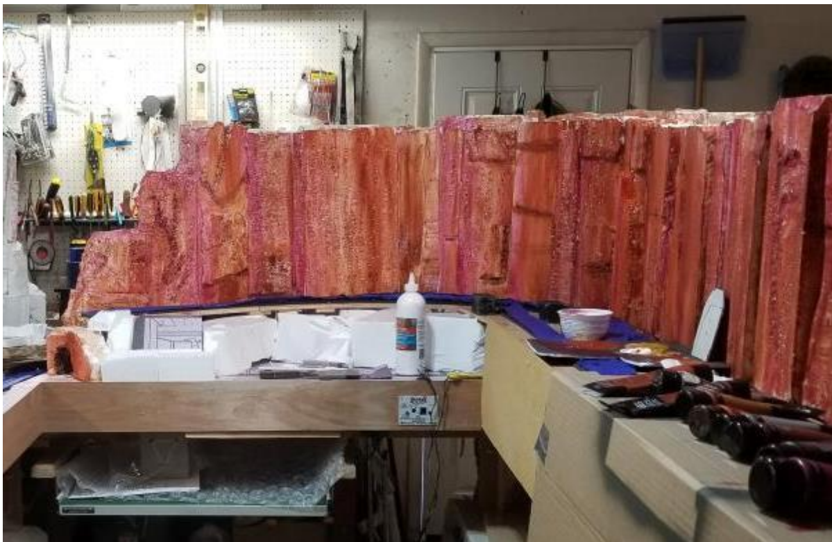
Rock walls with detailed painting