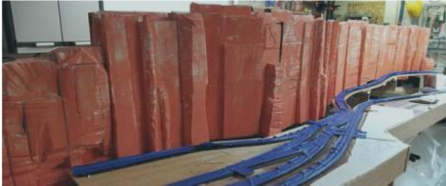
Rock walls with base color only