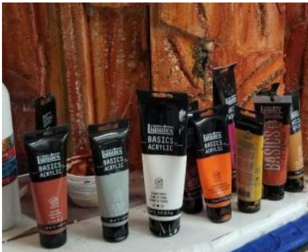
Tube paints used on walls

I worked two weeks and only progressed painting as far as the bridge pier on the first section. I realized that the tubes would become very expensive to complete the much longer extension across the bridge.