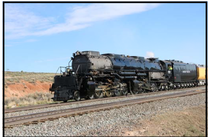
Prototype photo