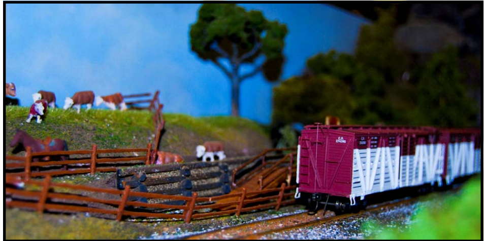
Cattle loading chute on the HO layout

Watch your email and the website for news about meetings and clubhouse opening under Phase II.