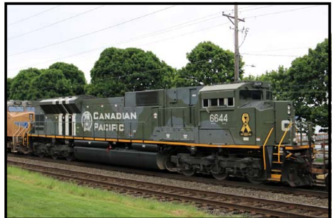
CP 6644, an SD70ACU, is an Commemorative Locomotive that acknowledges the 75 anniversary of the D-Day landings. 6644 wears the camouflage colors applied to Royal Canadian Air Force "Spitfire" fighter planes flown at the Allied invasion of Normandy, France on June 6, 1944.