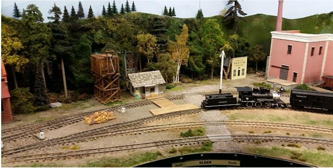
The town of Elder on the SS&S