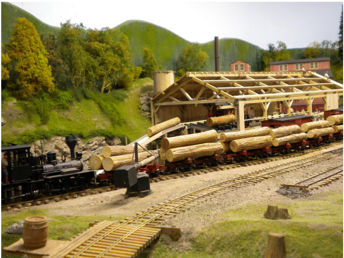
Sawmill, and operating jill poke to push logs into the log pond on the SS&S