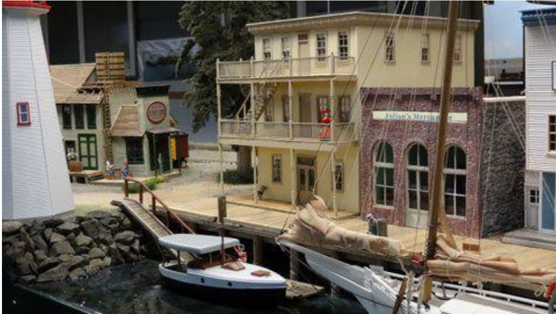
Oyster Bay Business District on the SS&S

See the SS&S track plan attached to the original email.