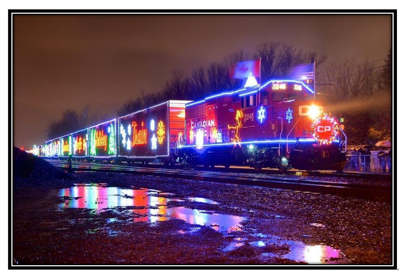
2017 Canadian Pacific Railroad Christmas train.

Train No. 12 Vol. 42 Issue: December 2017