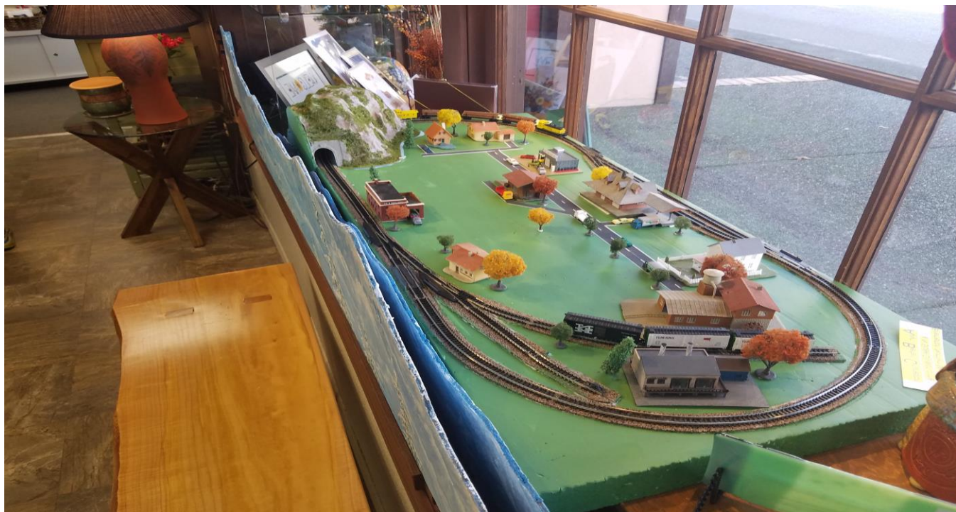
N Scale Layout in front window of Poulsbo's Verksted Cooperative Art Gallery