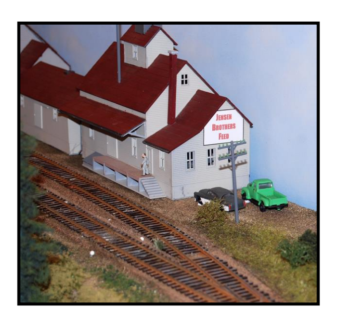
New Branch Line business

Train No. 10 Vol. 41 Issue: October 2016