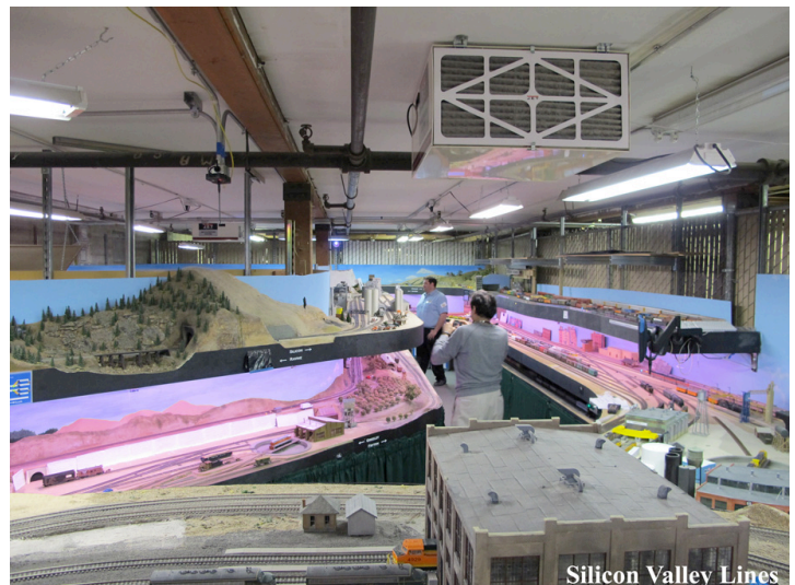
Silicon Valley Lines