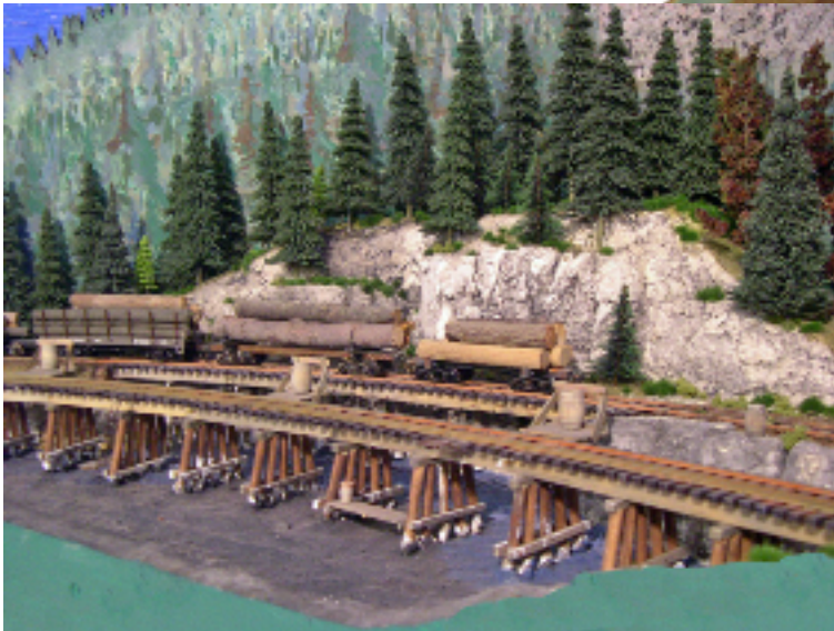
[left] Logging spur between Gate, WA and Tacoma