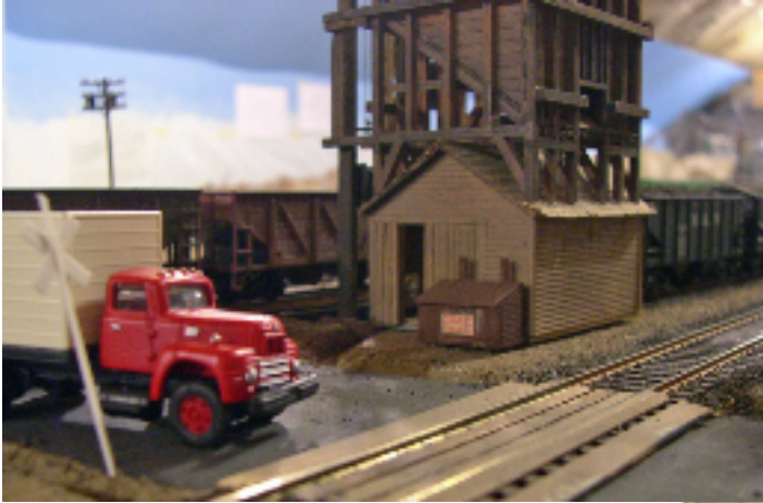
[above] Coaling Tower Hoquim Yard

Dick has been busy up in the attic on the Big Stump, Little Lump Lumber & Ore Railway with the main yard at Hoquim pretty much finished and the mountain by Montesano on the 'rise.' The track from Elma to Tacoma is coming along quite well with parts of it in a finished state. About the only benchwork to be built is the balloon track in the Tacoma yard.