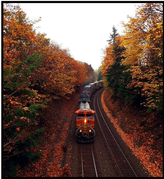
Fall Colors.