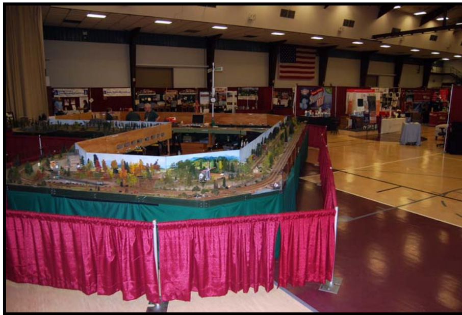
2016 Kitsap County Fair Sunday Operations